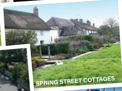
SPRING STREET COTTAGES