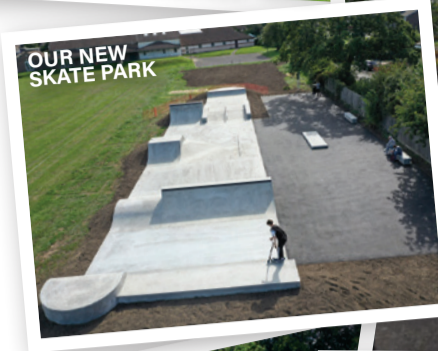
OUR NEW SKATE PARK