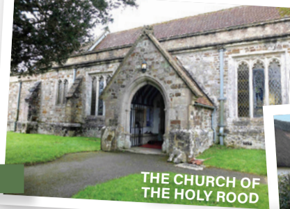
THE CHURCH OF THE HOLY ROAD

In the 12th Century, a Cistercian Abbey was established at Bindon on the eastern edge of the village. What little remains of the Abbey is sufficient to form an impression of the vast scale of the site. Amongst the ruins there's an open tomb which was used by Angel Clare to lay Tess in after he carried her from Woolbridge House. Today, the Abbey grounds are privately owned but are opened to the public on certain days for charity and are well worth a visit.