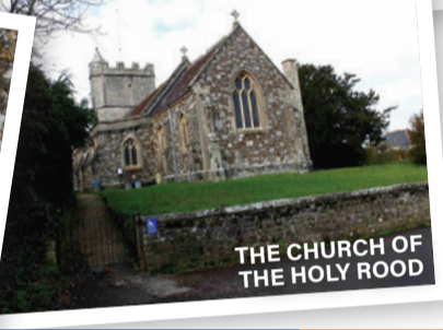
THE CHURCH OF THE HOLY ROAD

NOTICE DORSET ANY PERSON WILLFULLY INJURING ANY PART OF THIS COUNTY BRIDGE WILL BE GUILTY OF FELONY AND UPON CONVICTION LIABLE TO BE TRANSPORTED FOR LIFE BY THE COURT T & S GEO & C 30 S 13 T FOOKS