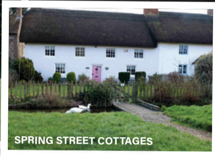
SPRING STREET COTTAGES